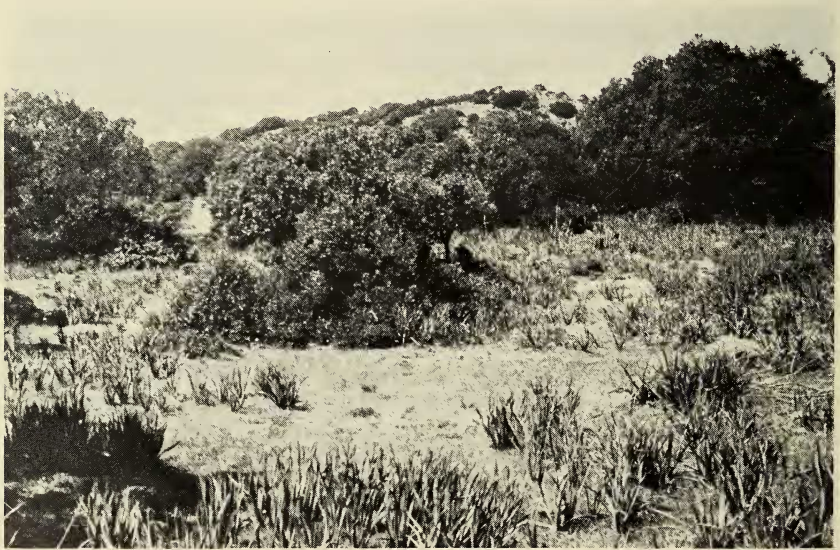
Fig. 5. Limestone hills with oaks at Annoceur, Middle Atlas (nr. 17 on the map), biotope of Zerynthia rumina L., Anthocharis belia L., Pseudophilotes abencerragus PIERRET and many others.